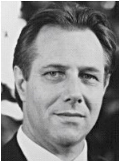
JT Walsh circa 1983

MetaScience Productions Box 32, Kingston, RI 02881 (401) 294-2414 mseifer@cox.net