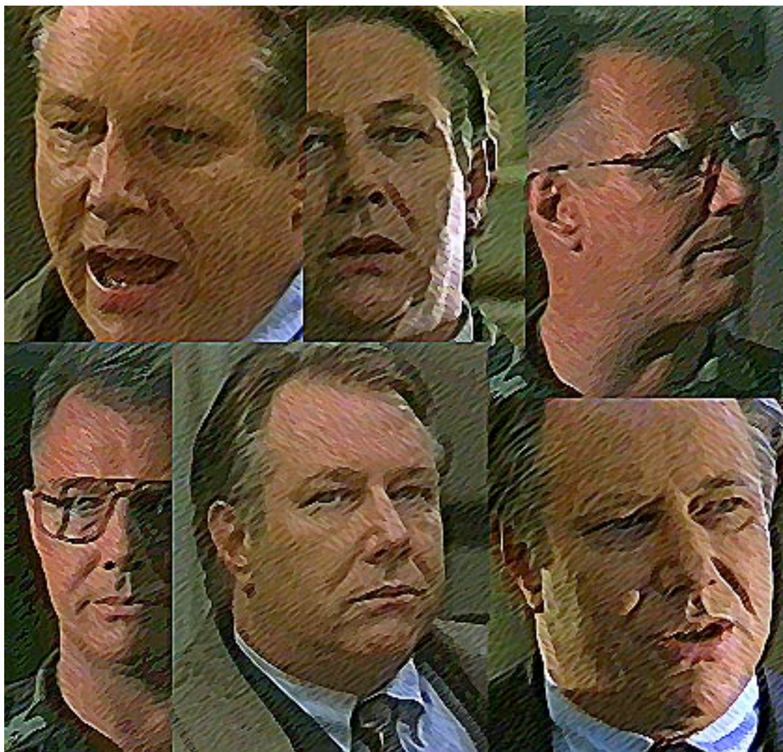
JT Walsh. Perhaps his most compelling role was as Lt. Markinson in A Few Good Men Bottom left of this montage retrieved off the net.